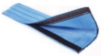
Wear sleeve with Velcro