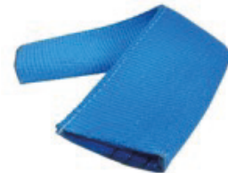
Wear Sleeve sewn both sides