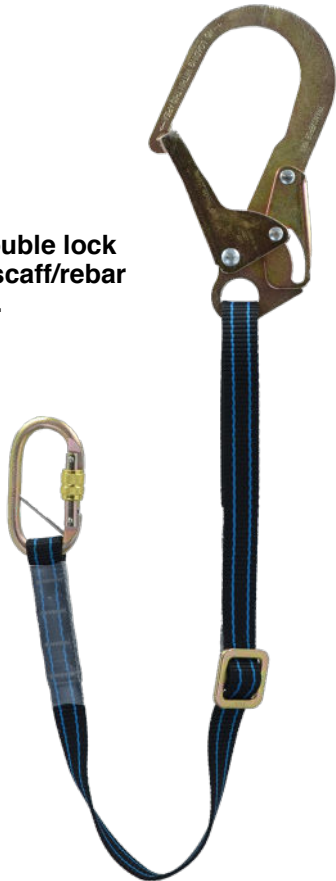
Captive pin double lock carabiner and scaff/rebar hook.