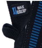
2.3kg tool loop

Captive pin double lock carabiner both ends.