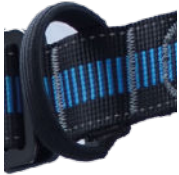
Soft UHMPE front attachment loop