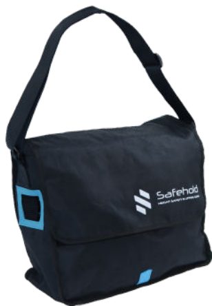
Convenient carry bag holds excess webbing while system is in use.