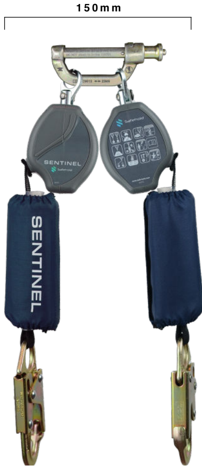
Dual SRL to ensure the user can always be clipped on