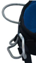
Integrated tool loops