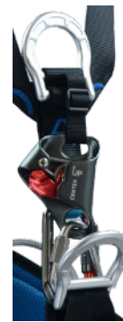
Aluminium hardware to keep the harness lightweight