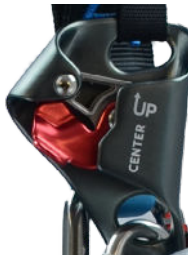
Comes with chest ascender

Standards: EN361:2002, EN358:2018 EN813:2008