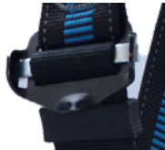
Alloy bar webbing adjuster