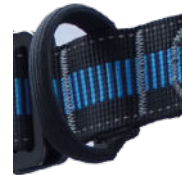
Soft UHMPE front attachment loop