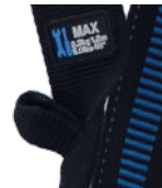
2.3kg tool loop