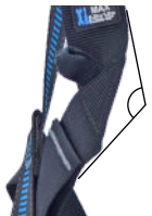
Patented hip fold