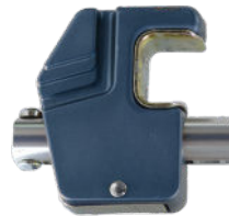
Steel jaw inserts