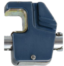
Dual Sliding jaws