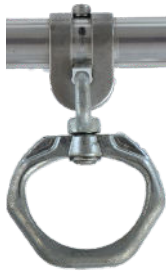
Large easy to connect attachment ring