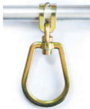
Large easy to connect attachment ring