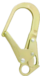
Non Swivel Hook